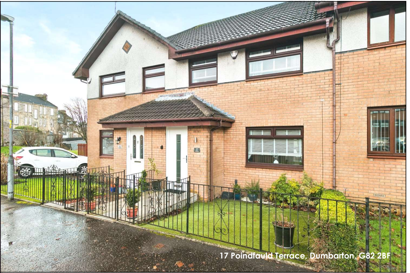
17 Poindfauld Terrace, Dumbarton, G82 2BF

David Muir Estates is delighted to offer this superb 3 bedroom mid terrace villa to the market. The caring owners have left no stone unturned in presenting their home in pristine condition throughout.